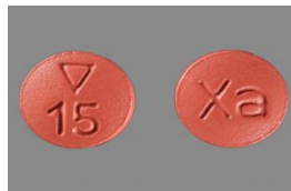
Xarelto 15mg tablet